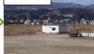
The temporary storage site clearing progress (Noda village, Iwate Prefecture)

Major public works projects using materials recycled from debris and tsunami deposits