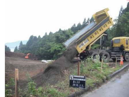
Ofunato-Ayasato-Sanriku line road improvement work