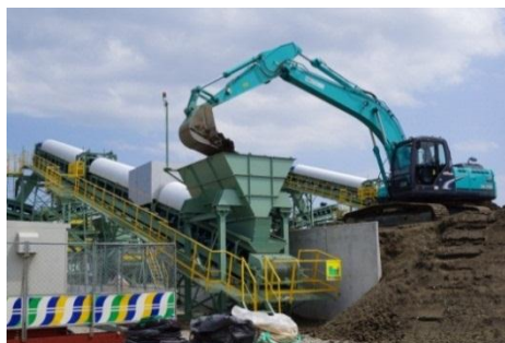
Treatment facility of tsunami deposit in Rikuzentakata city, Iwate prefecture (Test operation from May 7, 2013)