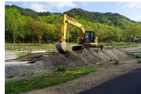
National park reconstruction project in Miyako city, Iwate prefecture (Started on May 23, 2013)