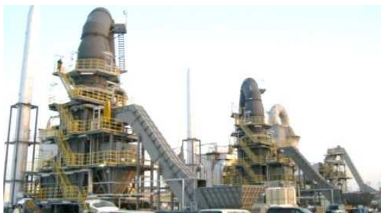
Temporary incinerators in Soma city, Fukushima (Operation started on Feb.20, 2013)