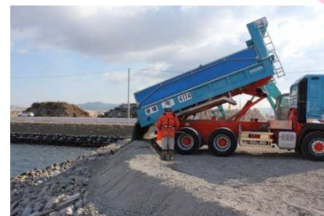
Ishinomaki Port embankment project (Landfill started on Feb.20, 2013)